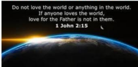
Comparison of Christian Tribulation Views

Average person still in fallen state is at 200 level (the dead)